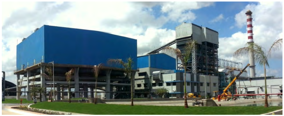
30 MW CFBC based Power Plant for Bharathi Cement (Andhra Pradesh) India