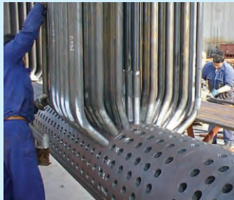
Bank Tube being assembled