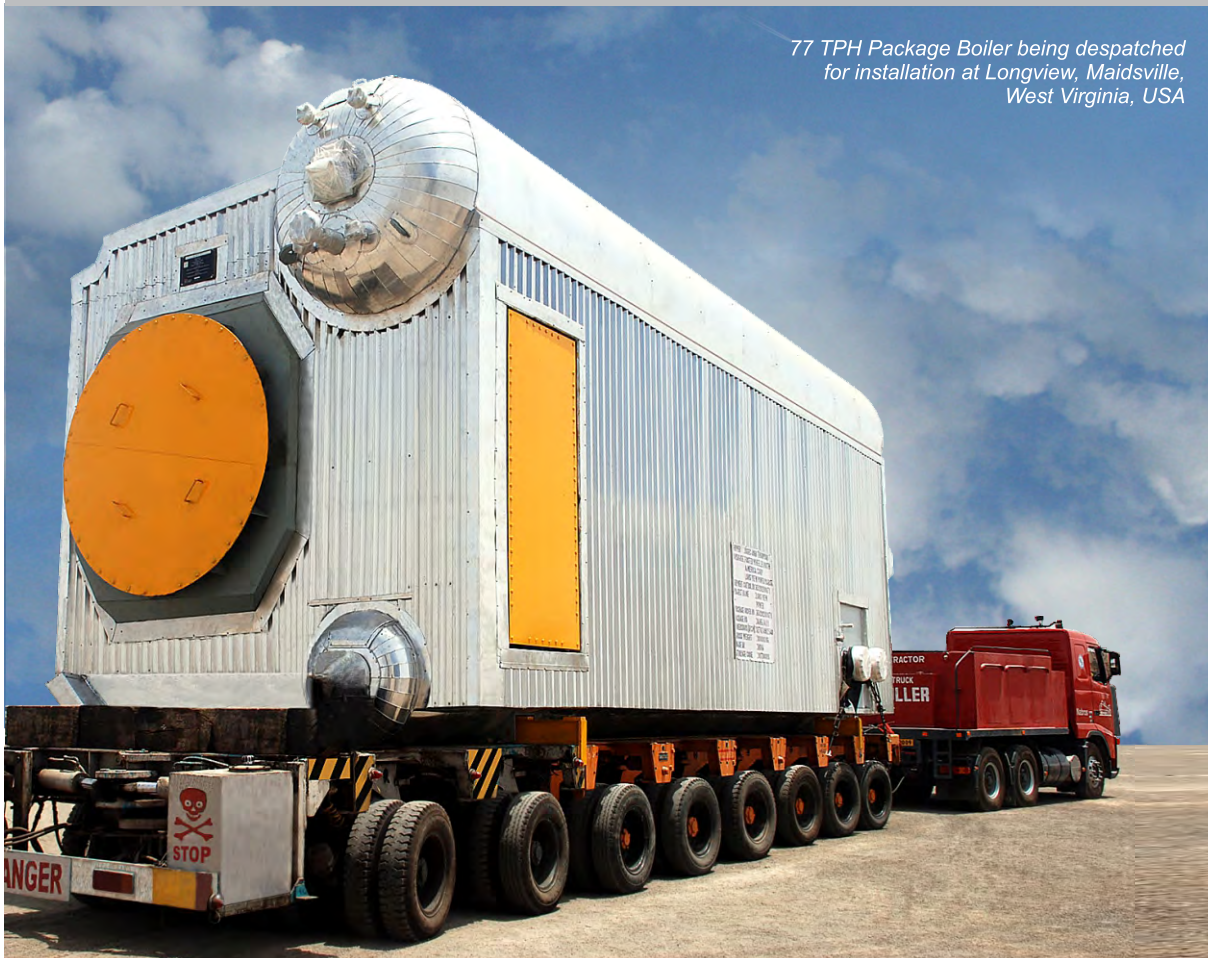
77 TPH Package Boiler being despatched for installation at Longview, Madsville, West Virginia, USA

A Licensee of Sumitomo SHI FW Energia Oy, Finland