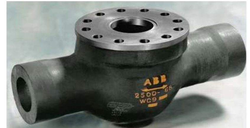
ABB Japan – 16" class2500, WC9