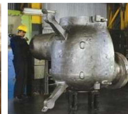
Alstom Mannheim - Valve Body