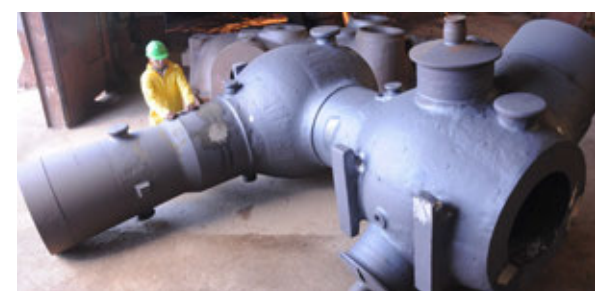
IV & CV Casing