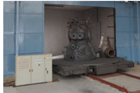
Shot Blasting PLC Controlled