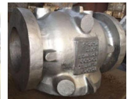
FLUITEK – 20" #600, WCB, 2T