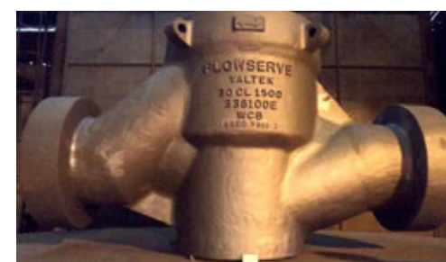
Flowserve – 30" Class 1500, WCB, 32 T