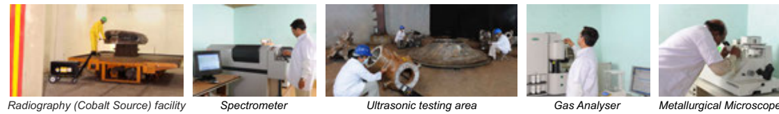
Radiography (Cobalt Source) facility Spectrometer Ultrasonic testing area Gas Analyser Metallurgical Microscope