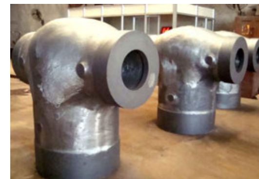
BHEL – 12" Class 2500, C12A, 2T