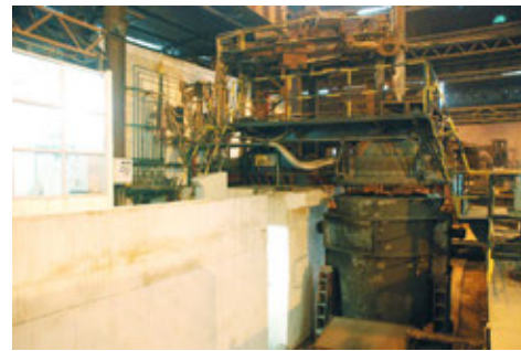
LRF 2 x 40T