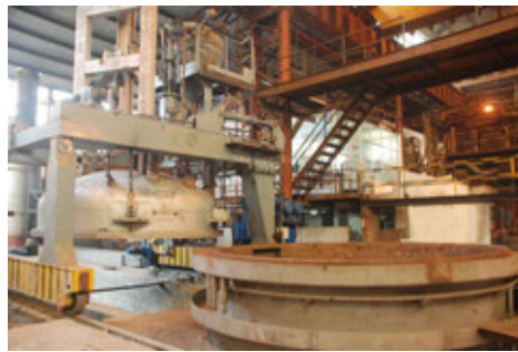
VD / VOD 40T