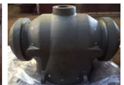
VIRGO – 20" #1500, LCC, 5T