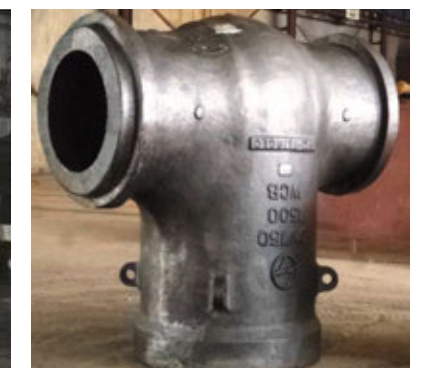
L&T Valves – 30" class 1500, WCC, 12T