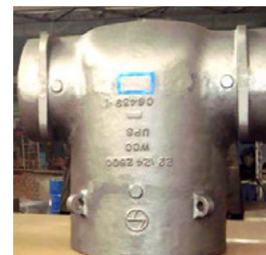
L&T Valves – 22"/24" class 2500, WCC/WC6, 8T