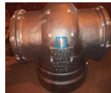
BHEL – 30" #900, C12A, 3T