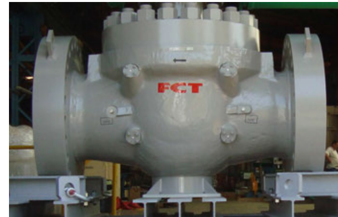
TYCO France – 24" Class 1800 , WCB, 22T