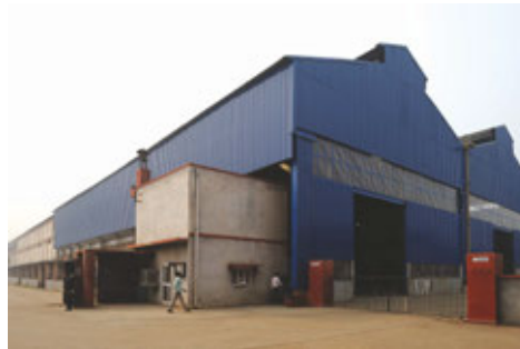
View of one of the Shop