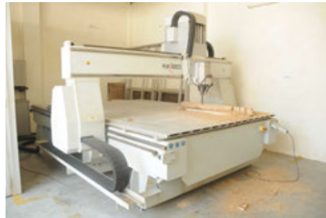
Flexicam Router CNC