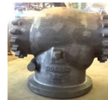
Leader Valve – 30" #600, WCB, 5T