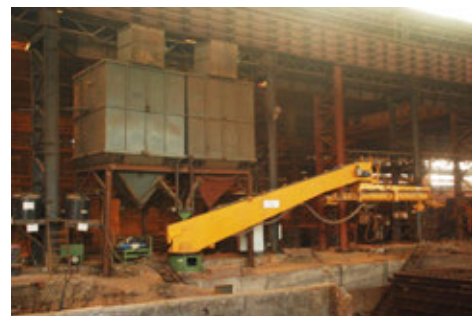
1 of 5 Articulate Continuous Mixers