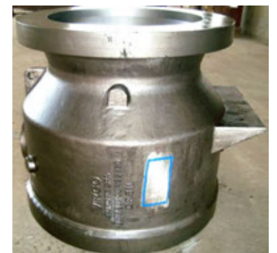
VIRGO Italy, 36"Class150, CF8M, 3T