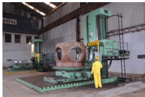
In house Machine Shop