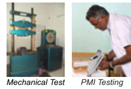
Mechanical Test PMI Testing