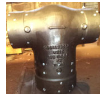
BHEL – 22" #3000, C12A, 7T