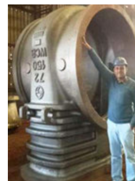
L&T Valves – 72" Class 150, WCB, 12T