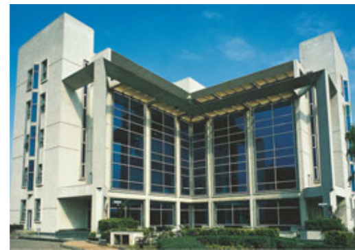
The Isgec Corporate Office at Noida, a suburb of New Delhi, India

A unit of Isgec Heavy Engineering Ltd. , a multi-product, multi-location public company that has been providing engineering solutions to customers around the world for the past 80 years. It ranks 257 in the ET Fortune 500 listing, and 265 in the Fortune India 500 listing.