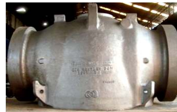
PIBIVIESSE ITALY – 48" class 300, WCB, 15 T