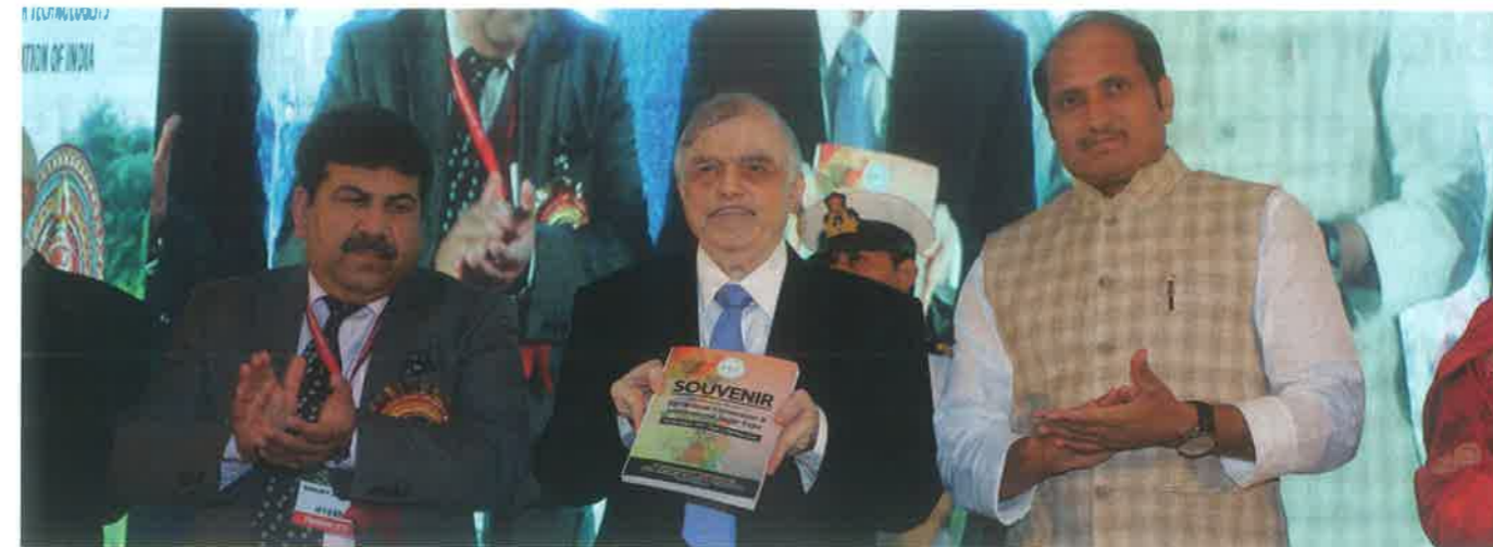
Launching the event proceedings