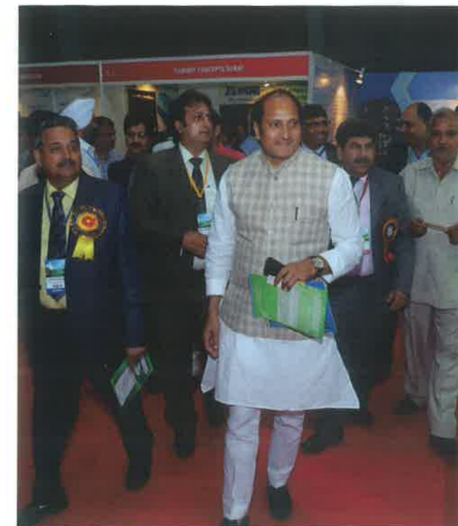
Dignitaries at the inauguration

During the event, 79 research papers were presented and deliberated by renowned experts on the latest innovations in five technical sessions on Sugarcane Agriculture, Factory Engineering, Factory Processing, Co-products and Management .