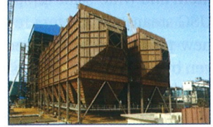
Electrostatic Precipitators*** (ESP)