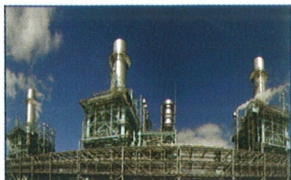
Heat Recovery Steam Generators** (HRSG)