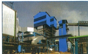
Travelling Grate Boilers (Bagasse, Biomass & Slop Fired/Vinasse)