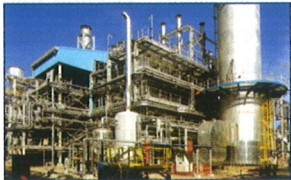
Oil & Gas Fired Boilers (Field Assembled / Package*)