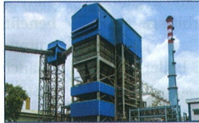
Circulating Fluidised Bed Boilers* (CFBC)