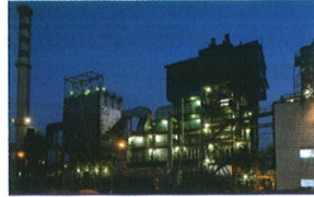
Atmospheric Fluidised Bed Boilers (AFBC)