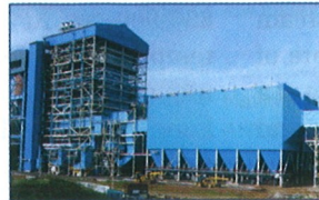
Pulverised Coal Fired Boilers* (PC Fired)